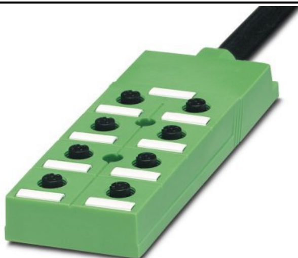
Sensor/actuator box, without LED, with master cable, markers and double-occupied slots

The illustration shows a version with 8 slots